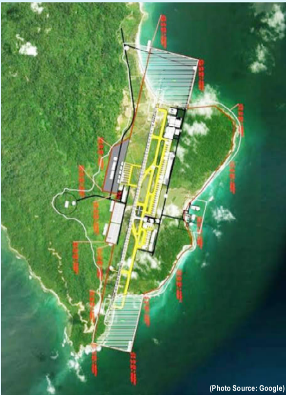
Strategic site: The Environment Minister said the project will help India counter expansionist action by China in the region.

Finally, the site of the project is unlikely to