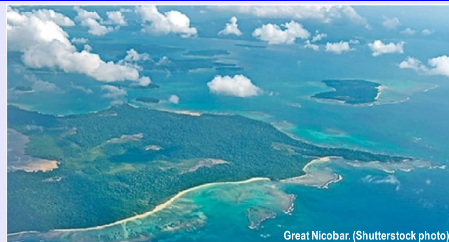
Great Nicobar.

The ministry was responding to a question